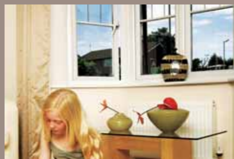
Manufactured to the highest standards, our windows never warp, bend or degrade - so they last and last.