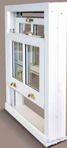
Combine the traditional and the modern with vertical slider windows

Whatever style you go for, you'll find our windows aren't just pleasing on the eye, they're practical too, requiring minimal maintenance and their good looks will last well into the future.