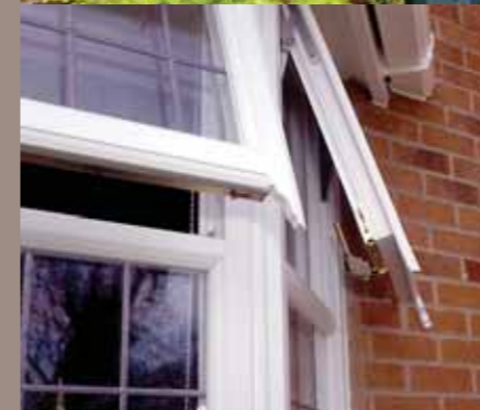
Top: Casement window Above: Mock Horn

“Attractive, durable and weather-resistant windows that complement the rest of your home.”